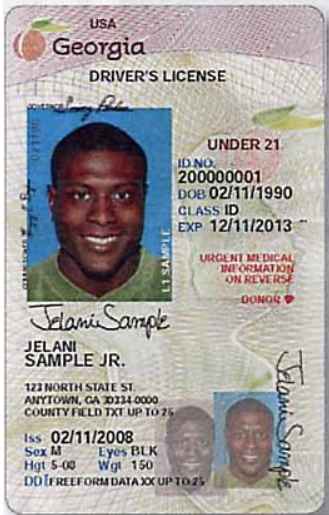
Under 21 Laminated Permanent License