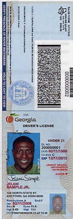
Under 21 Interim