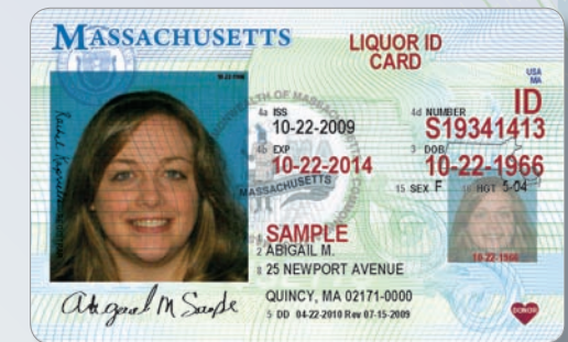
Liquor Identification Card