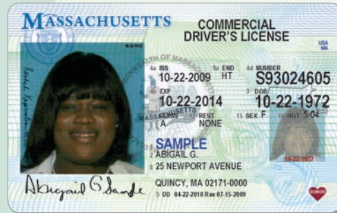
Commercial Driver's License