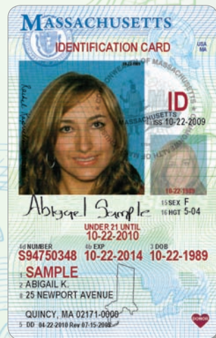
Under 21 Identification Card