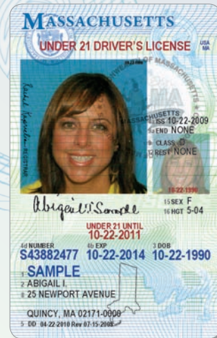
Under 21 Driver's License