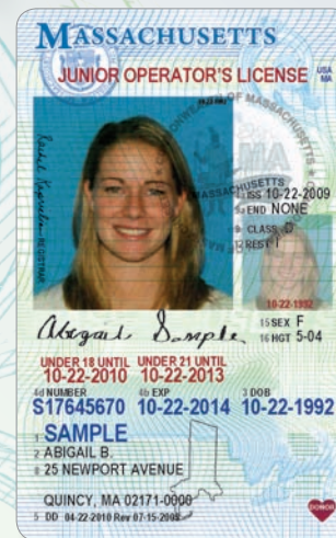
Junior Operator License