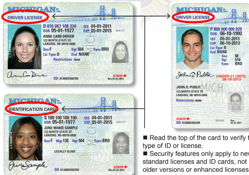
Younger Than 21 Format Driver's License